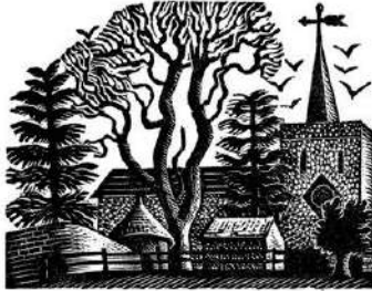
Bridge End Gardens Saffron Walden